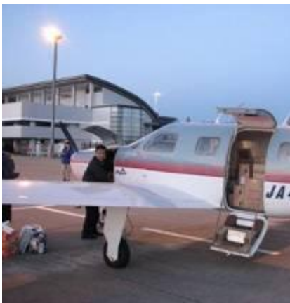
Arrived at Fukushima Airport