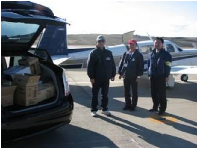
Now ready to fly back to Honda with quick goodbyes