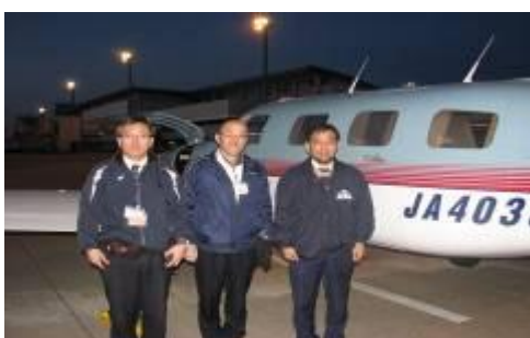
Finished our mission before sunset