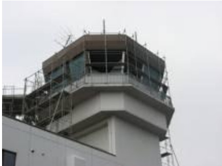
The tower with broken window

Our second pilot, Dr. Shioyasu, an AOPA-Japan pilot and a medical doctor (also an aviation medical examiner), flew from Honda Airport (near Tokyo) to Fukushima Airport (RJSP) filling his C210 cabin with precious cargo that could help to heal the injured and save lives. It was 20 th March, 9 days after the magnitude 9.0 earthquake rocked the whole country with 100 feet Tsunami over the coast line including Fukushima Nuclear Power Plant. When he landed at Fukushima, he noticed that the tower with broken window and found that controllers working on the 2 nd floor of the building without any view of the runway.