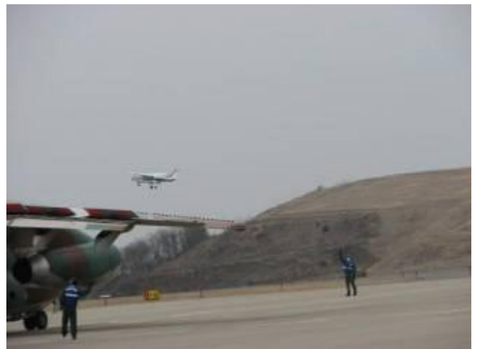
Back to Honda Airport (near Tokyo)