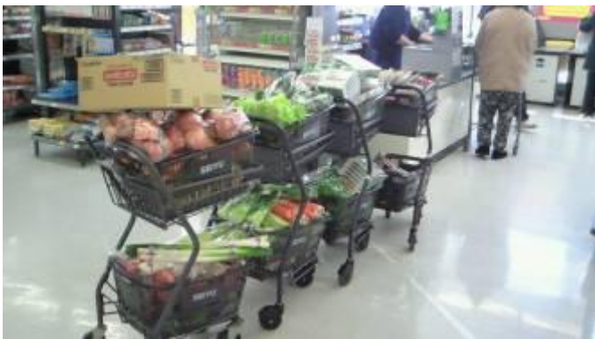
At local supermarket