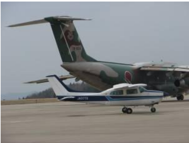
Only 40 min. flight from Honda Airport to Fukushima. Behind is JSDF C1 freighter