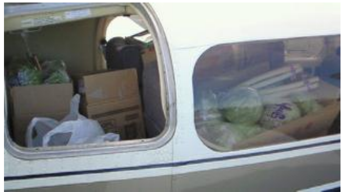
Full of food supplies in their Mooney