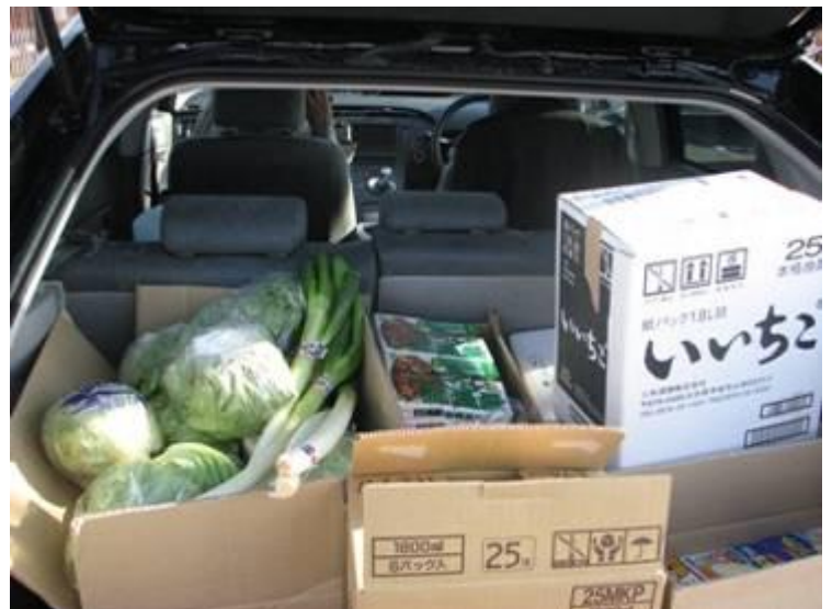
Full of Food Supplies in a Prius