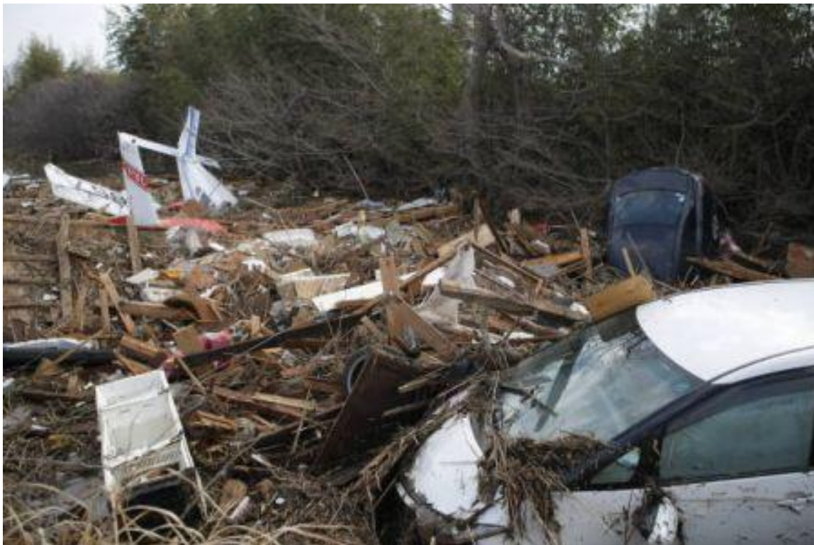
Sendai Airport (RJSS)

As we begin to learn more about the extent of the destruction and bad effect of the Nuclear Power Plant Accident, hear about the staggering death toll, and see heartbreaking images coming from the area, we all want to fly up to help. But government officials say that's not the best way to help now. Many AOPA-Japan pilots requested relief flight to Hanamaki Airport (RJSI) and Yamagata Airport (RJSC) where the closest to the major destroyed area after 3.11 (the 11 th March), because of the large number of relief flights already taking place by military aircraft and humanitarian agencies to get into the area and begin the relief effort, the best thing pilots can do for now is donate money and stay clear of the area. Many AOPA-Japan members donated money and some were used for the relief flights to Fukushima Airport (RJSP). As of 12 th April, the effect of the Nuclear Plant Accident continues, and we are standing by now for our next flight in near future.