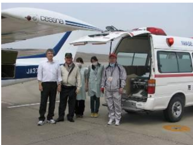
Our second mission went smother