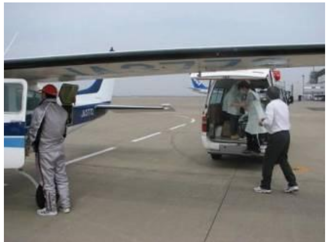
Local ambulance picked up the supplies