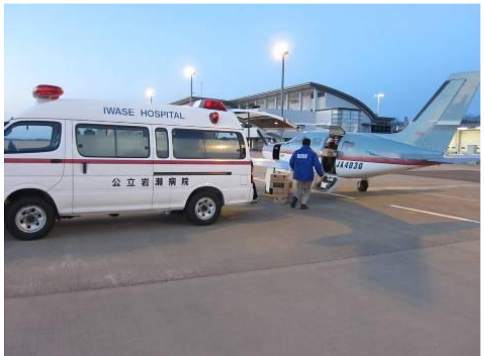
Full load of Medical Supplies were picked up by local ambulance