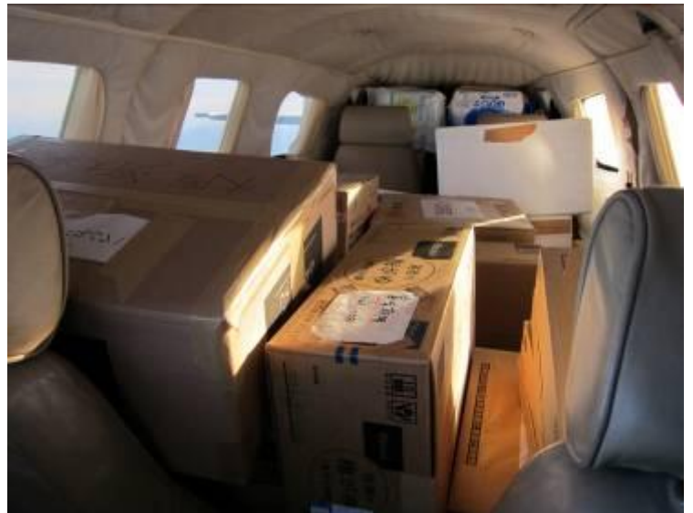
Full of Medical Supplies in Malibu cabin